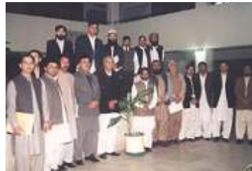
Group Photo of AIHuda Training Session at Peshawar.