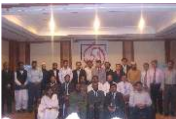
Participants of 2 days Specialized Training Workshop organized by AIHuda at Avari Hotel - Karachi