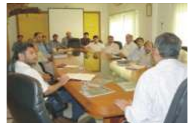
Seminar on Islamic Banking at SKB, Lahore.