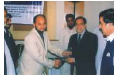
ALHUDA: Seminar on Islamic Banking at P.C Peshawar, 17th July 2006