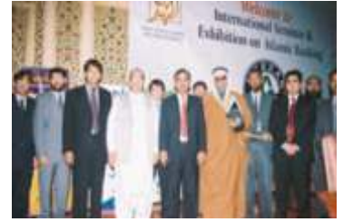
ALHUDA: International Seminar & Exhibition on Islamic Banking at Aiwan-e-Iqbal, Lahore. 29th April 2006