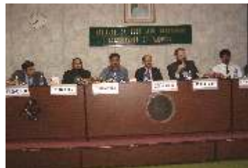
AIHuda - Takaful Workshop at ICMAP