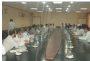
Seminar on Islamic Banking at Gujranwala Chamber of Commerce & Industry, Gujranwala..