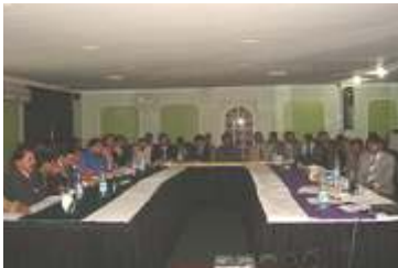
AIHuda Training Session on Islamic Banking at Multan