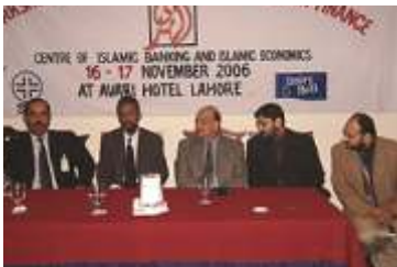
Speakers of Islamic Housing Finance Training Session