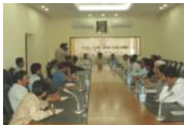
Seminar on Islamic Banking at FPCCI, Lahore.