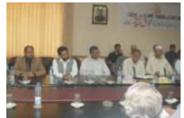
Seminar on Islamic Banking at Sarhad Chamber of Commerce & Industry, Peshawar.