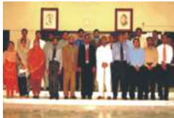
Training Session at Faisal Bank, Faisalabad