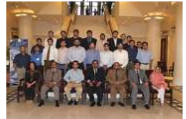
Group Photo of Training Workshop on Ijarah & Murabah