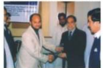
ALHUDA: Seminar on Islamic Banking at P.C Peshawar, 17 th July 2006