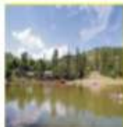
Azad Jammu & Kashmir