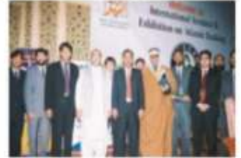
ALHUDA: International Seminar & Exhibition on Islamic Banking at Aiwan-e-Iqbal, Lahore. 29 th April 2006