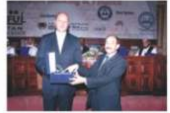
ALHUDA: 2 nd International Conference & Exhibition on Islamic Banking & Finance at Aiwan-e-Iqbal Lahore. 25 th August 2008