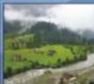
Azad Jammu & Kashmir