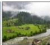
Azad Jamu & Kashmir